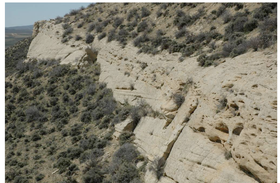
The Fox Hills river-dominated delta clinothems with overlying fluvial channel deposits

SEPM's Field Research Conference on 'Clinoform sedimentary deposits: The processes producing them and the stratigraphy defining them' attracted 71 participants in the Western Wyoming Community College of Rock Springs Wyoming, August 15-18, 2008. The 4-day lecture, poster and fieldtrip conference on siliciclastic clinoforms at delta and shelf-margin scales succeeded in bringing together three research communities: marine geologists on modern deltas, sedimentologists on ancient deltas and shelf margins and sedimentary-process modelers. Their goal was to focus on clinoform landscapes and on the associated clinothem deposits and processes. During two initial days there were keynote and other short talks, as well as poster presentations. Poster presenters gave a brief overview of their posters in the plenum session. The 3<sup>rd</sup> and 4<sup>th</sup> days were field trips to areas with well-exposed clinothems.