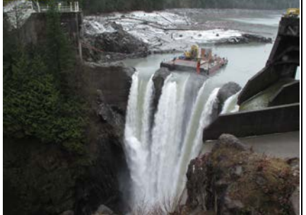
Figure 5. Removal of Glines Canyon Dam, Elwha River, WA.