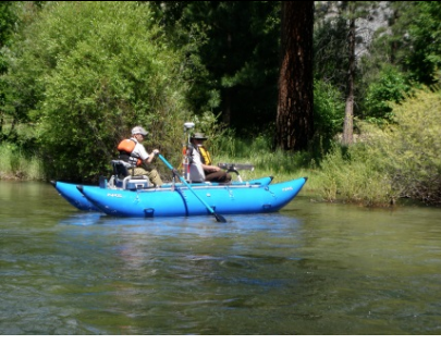
Figure 2. River channel surveys from a raft using GPS and depth sounder.