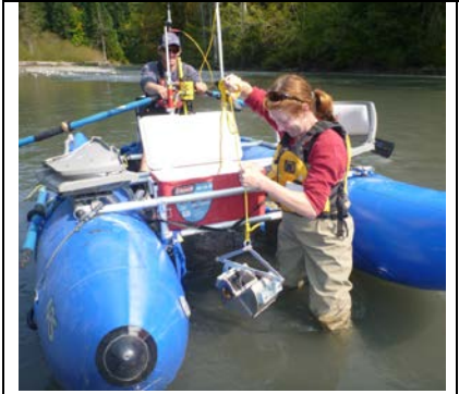
Figure 1. Sediment sampling on the Elwha River, WA.