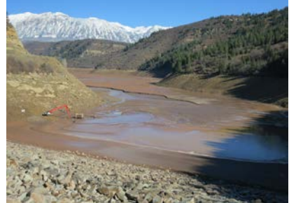
Figure 6. Sedimentation in Paonia Reservoir, CO.